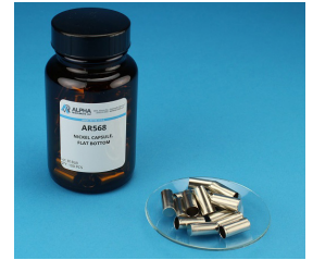
Smooth Wall Nickel Capsule (H= 14.5mm, D= 7mm) Flat Bottom AR568 (502-822)