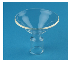
Utility Funnel AR473 (502-023)