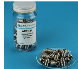
1.0g Nickel Basket, Ultra High Purity AR2344 (502-344)