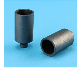
Graphite Crucible (Dimension: H=1.25" x OD=0.625") AR619 (619-895)