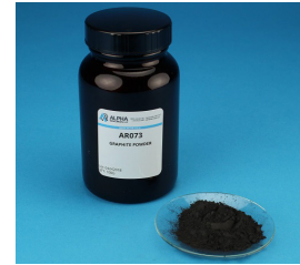
Graphite Powder AR073 (501-073)