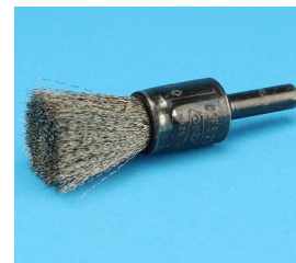
Electrode Cleaning Brush AR652 (774-652)